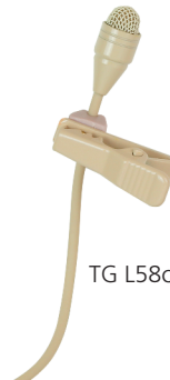
TG L58c tan